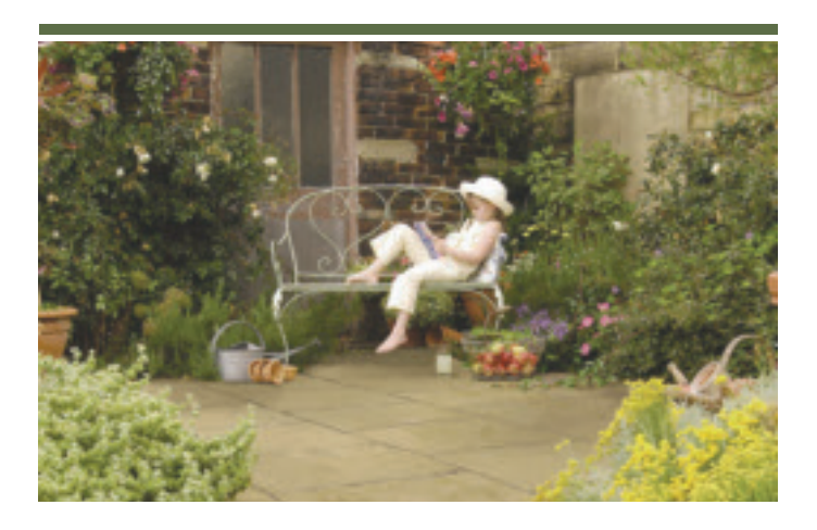
Marshalls Landscape Products Sustainability and carbon impact reduction

The scheme has sustainability benefits for both customers and suppliers and provides a valuable contribution to Government waste, recycling and landfill reduction targets for 2012 and 2015.