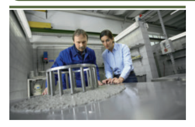
BASF Construction Chemicals Energy Management

BASF's 'Energy management' project demonstrates that the use of the company's products can save three times more greenhouse gas emissions than the entire amount caused by the production and disposal of them.