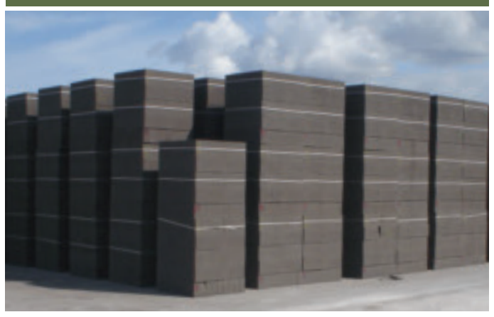
Forticrete Innovative use of recycled materials

Charities are supported through the company's staff accident reduction incentive scheme; for each of the three separate factories which have an injury free month, £250 is donated to a local cause nominated by an employee.