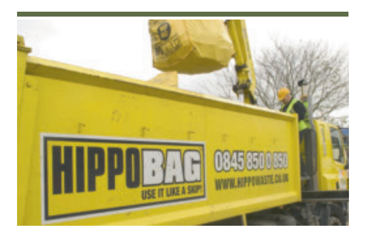
Tarmac Topblock Takeback scheme

This level of recycling - the company's Newlite product, for instance, is manufactured from 90% recycled material - has many benefits: the regeneration of brownfield sites, the effective and cost-effective replacement of quarried or manufactured aggregates, the provision of lightweight aggregate with a sustainable supply, and a huge reduction in CO_2 emissions.